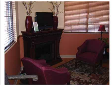
The new Greece office offers a comfortable and home-like waiting room.