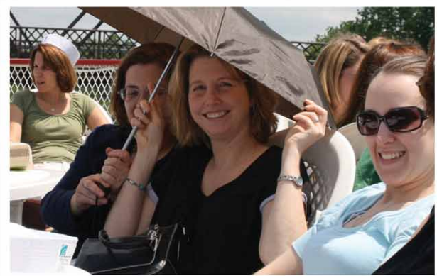
RHSC staff enjoy the sunshine on the cruise.

Challenges ahead remain significant. While benefiting from our rich history spanning over 85 years we must continue to rise to meet the rigorous demands confronting most not-for-profit organizations in our community. We face competition in each of our lines of business, a changing reimbursement and regulatory environment and ever increasing competition for philanthropic support. I am confident that, together with our dedicated staff and volunteers, we will continue to address and overcome these challenges.